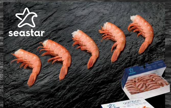
SEASTAR® HLSO ARGENTINEAN RED SHRIMPS

Size: L1 10-20, L2 21-30, L3 31-40 p/kg Specifications: raw Packaging: 6x2 Net weight: 12 kg