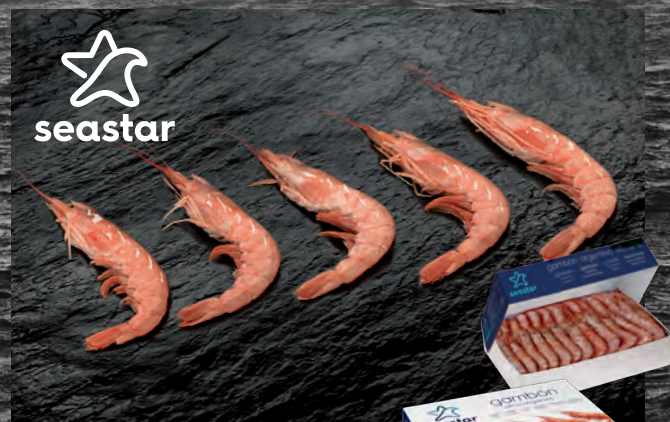
SEASTAR® HOSO ARGENTINEAN RED SHRIMPS

Size: L1 10-20, L2 21-30, L3 31-40 p/kg Specifications: raw Packaging: 6x2 Net weight: 12 kg